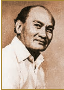
Dr. Salvador P. Lopez